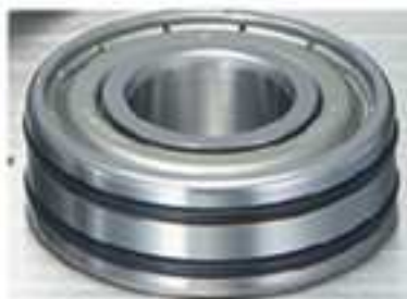
Fig.1 Creep-free Bearing

The creep-free bearings are introduced to production engines shipped from September 2019 and thereafter. (The priming pump of 6EY18(A)L engines destined to the Japanese shipyards, because of differences of parts (made by MANSEI INC.), are outside the scope of this Service News.)